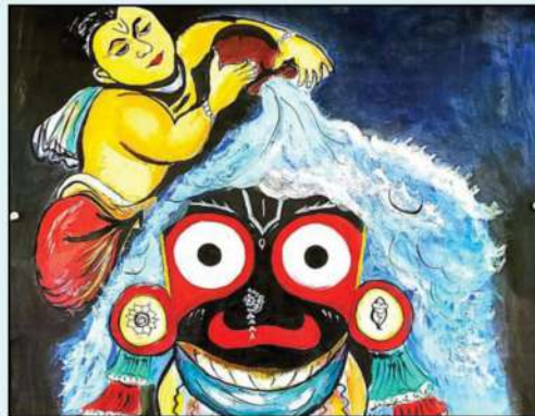
SATYAJIT MOHAPATRA, CLASS-VI OAV PITATALI, CHIKITI, GANJAM